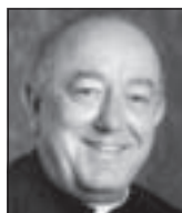
FROM THE ARCHBISHOP