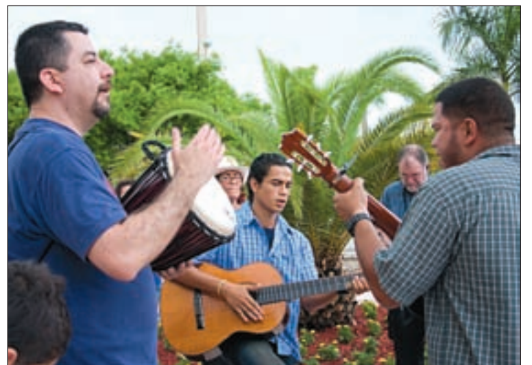
Members of the Camino Neocatecumenal (Catechumenal Way) sing hymns outside St. Mary Cathedral prior to the installation Mass.