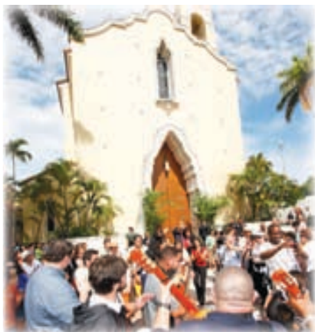
Throngs of people play music and dance outside St. Mary Cathedral as they wait for their new archbishop to emerge.