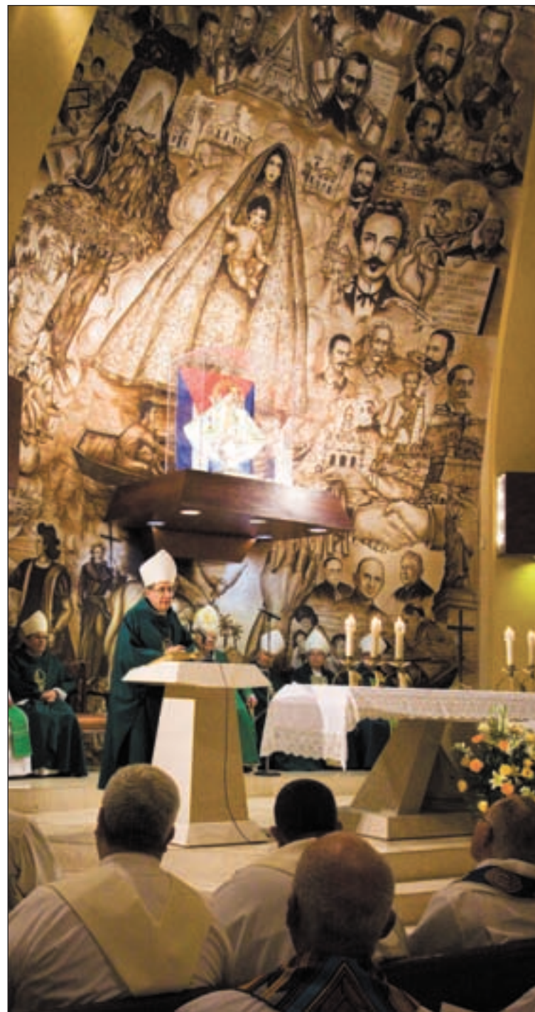
Under the mantle of Cuba's patroness at the National Shrine of Our Lady of Charity in Miami, Santa Clara Bishop Arturo Gonzalez addresses those present for the opening Mass Nov. 8 of the meeting between Cuban religious leaders living abroad and on the island.