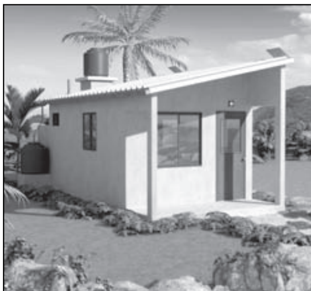
At left, a rendering showing both the frame and tented covering of the house. At right, the final version of the house with the stucco exterior in place.