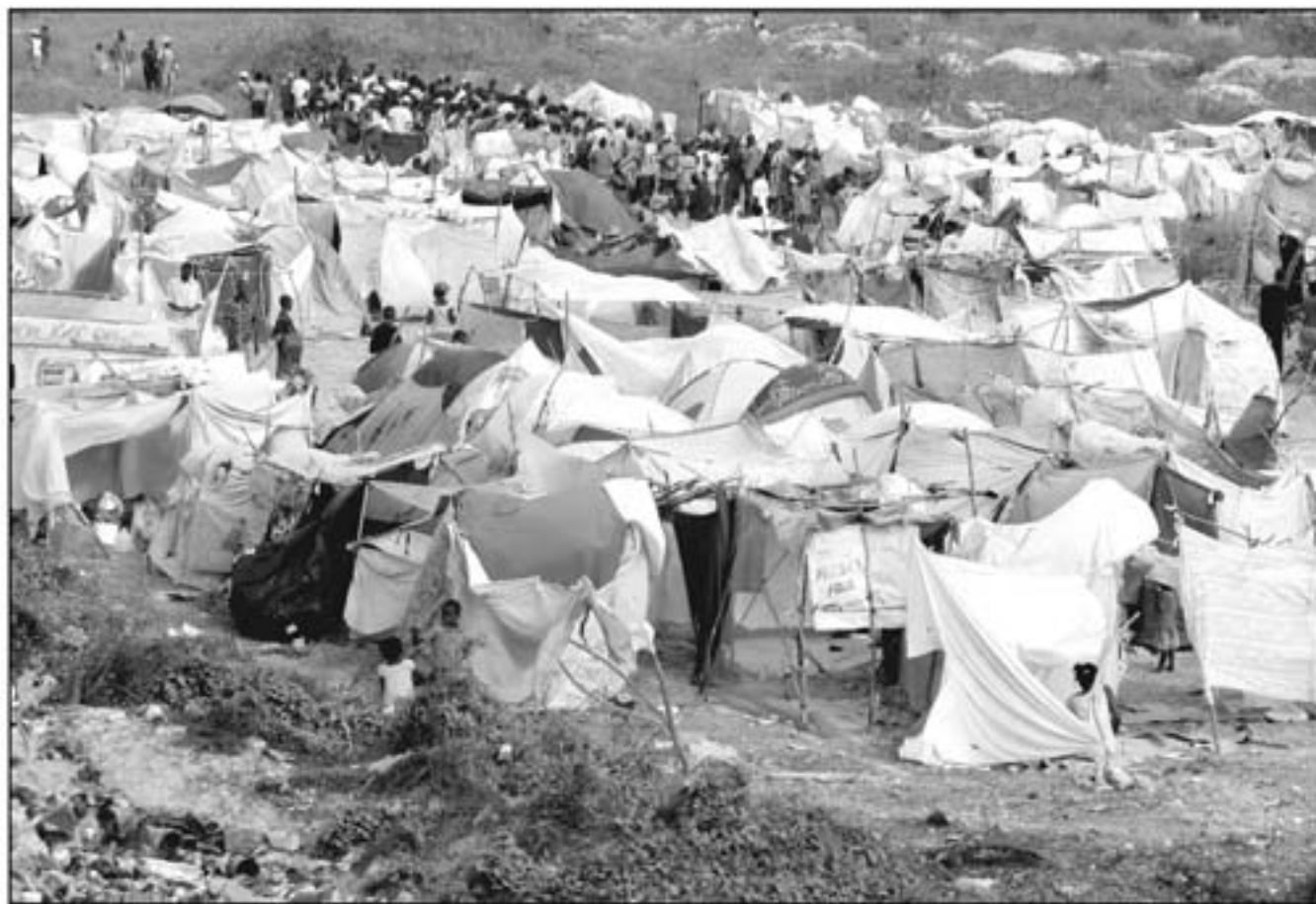
Huge tent cities can be found throughout the Port-au-Prince area, but many earthquake survivors seek safer shelter in the country's rural towns.

Since the six-month anniversary of the earthquake, much of the aid efforts have shifted to long-term recovery. Though it will be years before Haiti's capital city is restored,