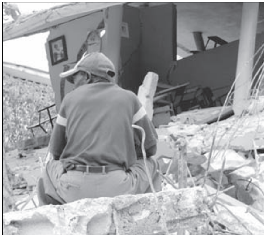
Everywhere you turn in Port-au-Prince, you see the rubble and ruin of destroyed homes and lives.

When the home owners are ready, the final phase of construction is organized. This involves covering the outside of the house with a proprietary stucco-like material that — once dried and painted — looks like one of the many cement homes common to Haiti. A single-family home can be built for just $5,000 to $10,000.