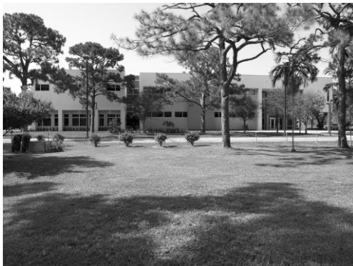
Carnival Cruise Lines Science & Technology Building

All courses in the program will use teaching strategies that integrate practical applications through fieldwork, online techniques, teamwork or other applied practices with research.