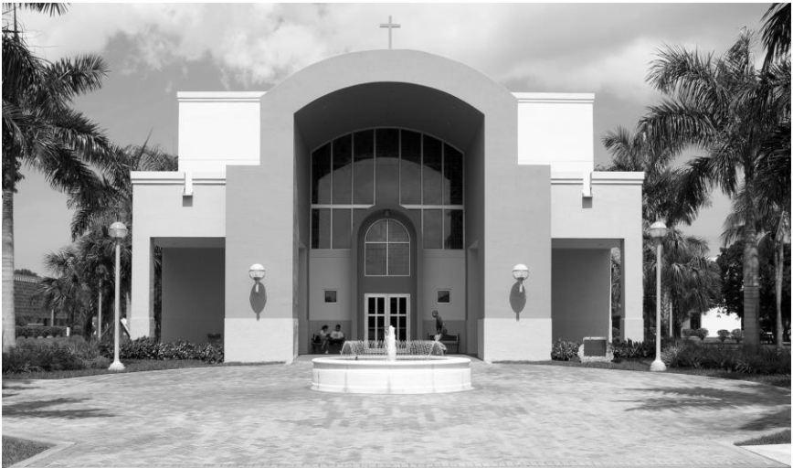
Chapel of St. Anthony

St. Thomas will position as the leading Catholic university in the Southeast by developing, through its academic programs, recognized global leaders in ministry, science, business and justice, and will serve as a model resource that prepares its students to engage in the business, legal, social and scientific universe of the global community.