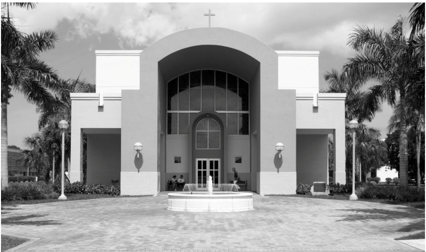
Chapel of St. Anthony

St. Thomas will position as the leading Catholic university in the Southeast by developing, through its academic programs, recognized global leaders in ministry, science, business, and justice, and will serve as a model resource that prepares its students to engage in the business, legal, social, and scientific universe of the global community.