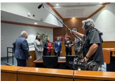
CNN Comes to Campus